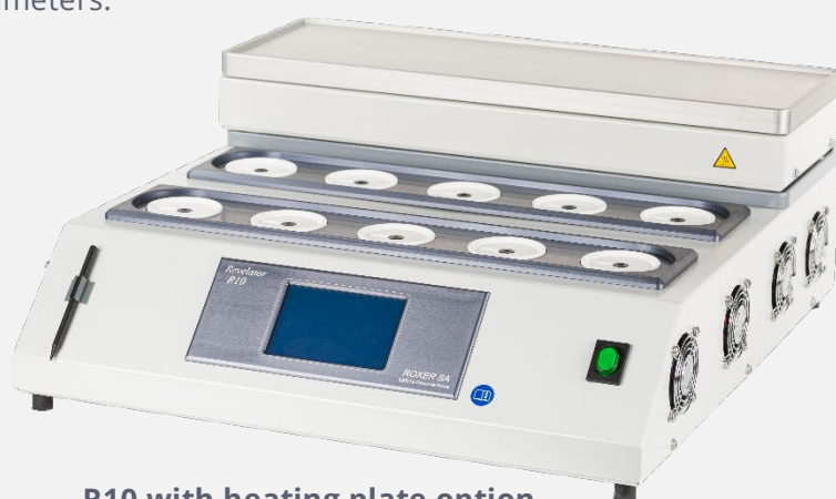
R10 with heating plate option