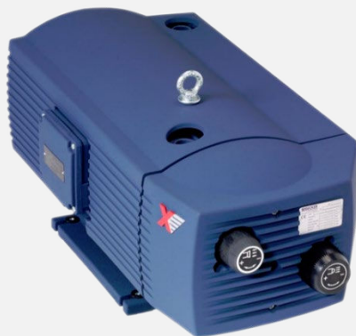
VX 4.16 VX 4.25 VX 4.40