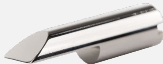
Flat blade Ø6 de 30°